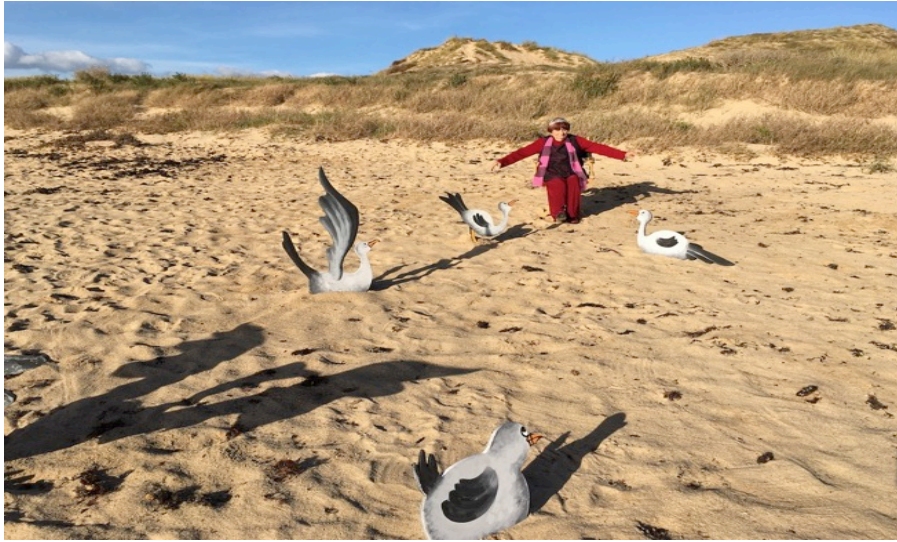
Agnès Varda on the set of VARDA BY AGNÈS , 2018