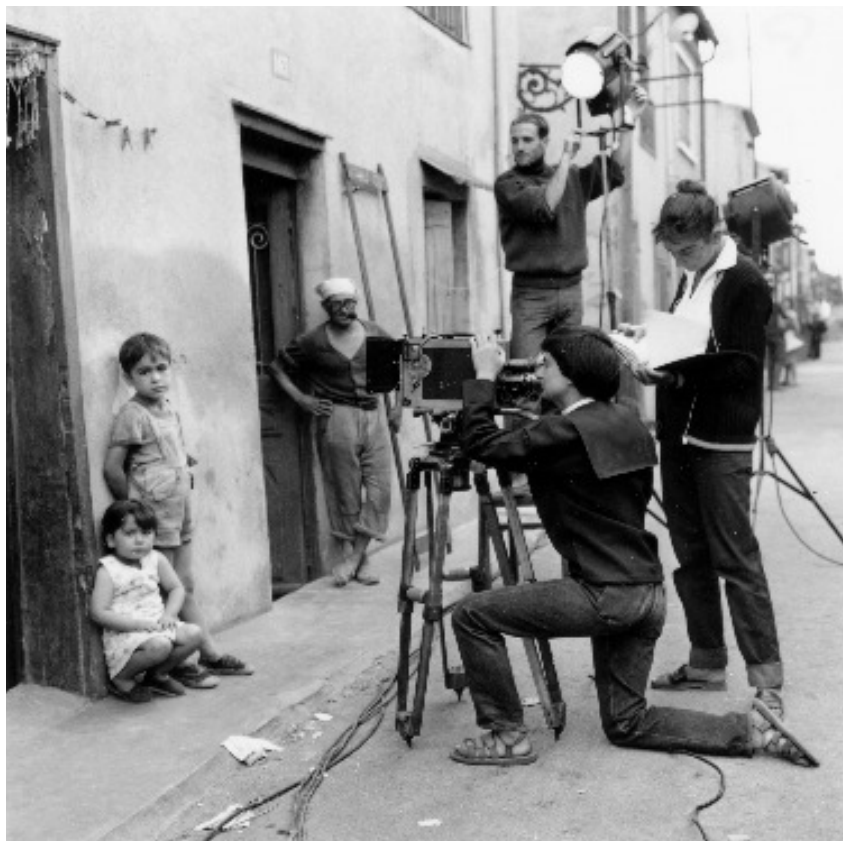
Agnès Varda on the set on the first day of her first film, LA POINTE COURTE , July 1954